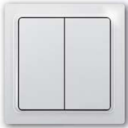
Pushbutton with double rocker